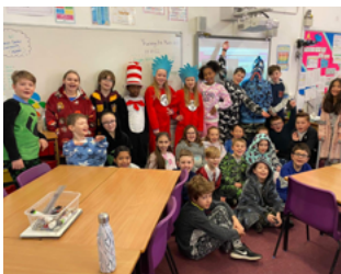
World Book Day