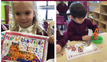
Lunar New Year

As part of Kents Hill Park's Lunar New Year celebrations, Potter Class learned all about the Chinese Zodiac and found out some interesting facts about the Year of the Tiger.