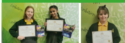
Young writers competition

Middleton pupils love to enter competitions, especially those that focus on writing. Original pieces submitted to the Young Writers 2022 competition from pupils in Year 5 and 6 will now be published in a book. The suspenseful stories and exceptional poetry left staff in awe of the young creative writers and, once in print, will be a fantastic keepsake for the pupils.