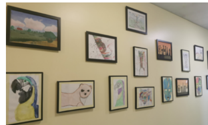
Art on display

To showcase and celebrate the work of Middleton's talented young artists , the school has created its very own art gallery.