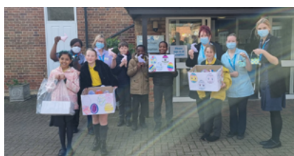
Gifts for Willen Hospice

During Wicked Work Week, Year 6 children created gifts for staff and patients at Willen Hospice. They made cards, weaved baskets with 3D eggs, sewed bunnies and created an Easter stained glass window effect. The staff were delighted to receive the gifts and to deliver them to the patients.