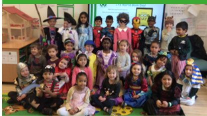
World Book Day

The school raised £220.15 on World Book Day, which will be used to purchase new literature for the school.