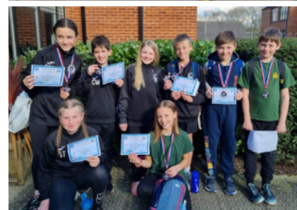
Badminton team (top), Swim team (bottom)

During Wicked Work Week, Year 6 children created gifts for staff and patients at Willen Hospice. They made cards, weaved baskets with 3D eggs, sewed bunnies and created an Easter stained glass window effect. The staff were delighted to receive the gifts and to deliver them to the patients.