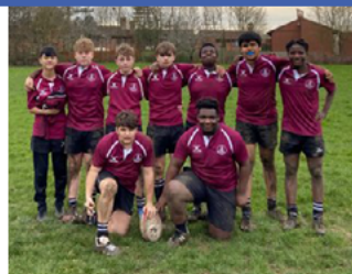
Year 10 Rugby

There was a nice boost to the start of the day for the Headteacher when an unexpected gift was left on his desk. After the treats were thoroughly enjoyed, the mug was restocked and passed on.