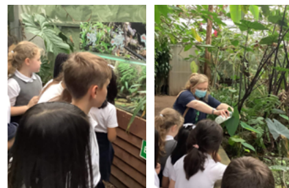
Living Rainforest visit

As part of Year 3's topic on Brazil, pupils visited The Living Rainforest . Guides helped the children discover how animals and plants have adapted to the rainforest habitat.