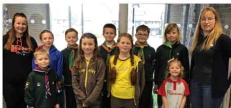
World Thinking Day

Oakgrove's Cubs, Rainbows, Brownies and Guides celebrated 'World Thinking Day' in February by joining other groups from 150 countries. The theme for 2022 is 'Our World: Our Equal Future: The Environment and Gender Equality.'