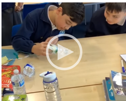
Mini desk vacuums

Year 6 showed off their impressive engineering skills when they created mini desk vacuums.