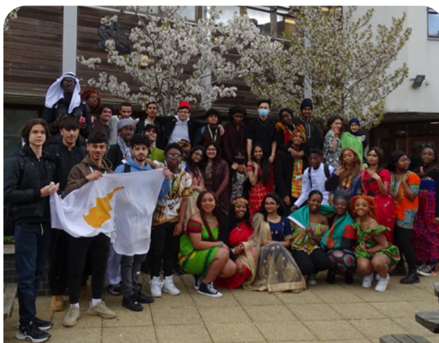
Sixth Form Culture Day

The new and reformed National Professional Qualifications (NPQs) programme has launched with online and in-person tuition. The courses will be delivered by trusted local partners working in partnership with UCL Institute of Education. The fantastic professional development opportunities will in part take place at the new Oak Leadership Training Centre at Oakgrove School and are designed for teachers and leaders to take the next step in their careers. For more information visit the website at mknpq.partners