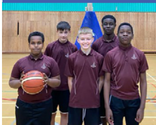
Year 9 Basketball

All the school's sporting stars should be as proud of their achievements, as the school is of them.